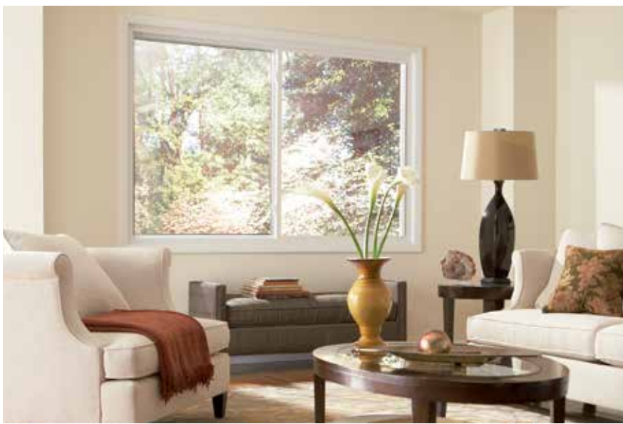
Above Top: Fusion Double-Hung Windows feature a constant force balance system to ensure smooth operation; both sashes tilt in for convenient cleaning from inside your home. Above: Fusion Sliding Windows glide horizontally on a nylon-encased dual brass roller system, and the sashes lift out for easy cleaning.