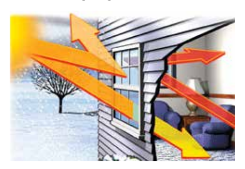
Winter Energy Savings: Low-E insulating glass reduces heat loss by reflecting warm air back into your home.